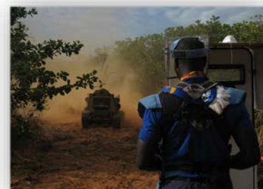
TECH4DEV UNESCO Conference